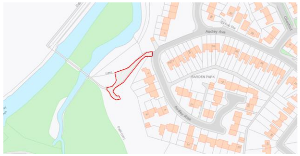
Map above showing dogs on lead area within Audley Rise Car Park