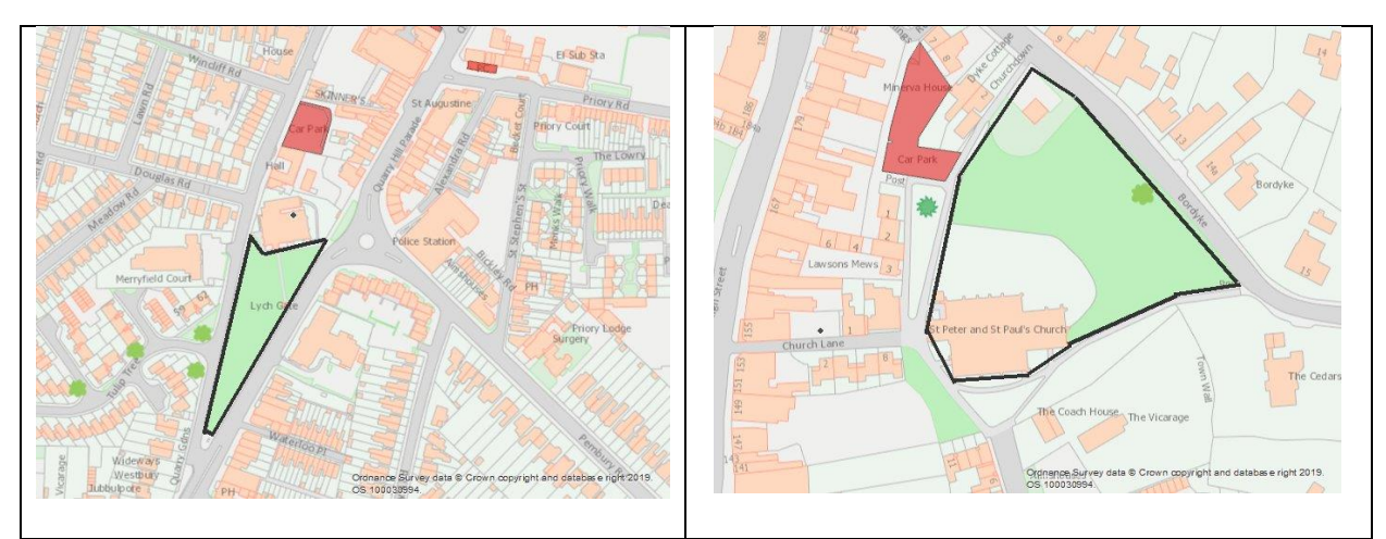
St Stephen's Churchyard