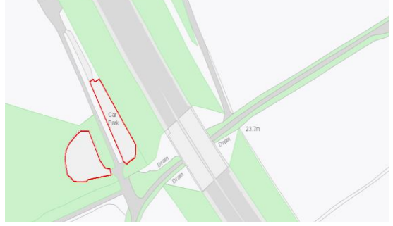
Map above showing dogs on lead area within main car park and catering area within Haysden Country Park

No person may camp in any place within the Country Park unless specifically authorised in writing by the Council.